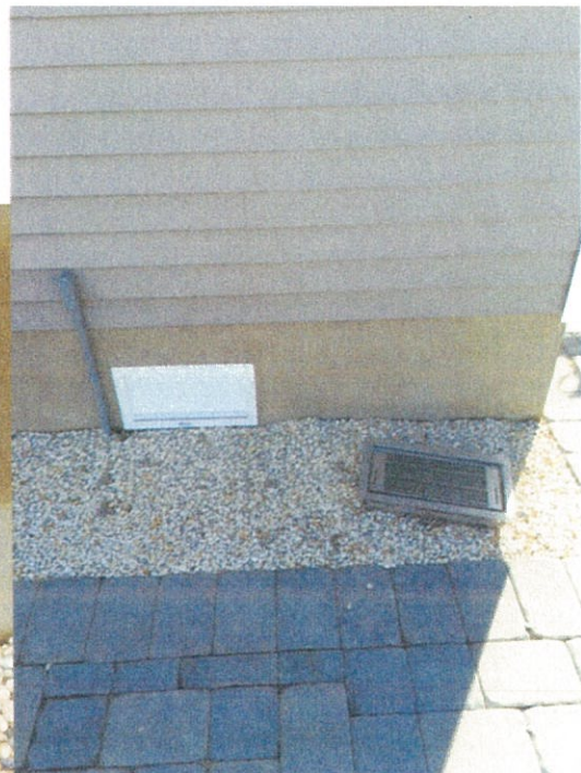
1 Peg Leg Way, USA Flood Air Vent, 10/28/14