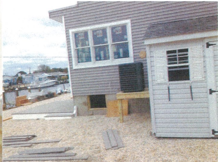
1 Peg Leg Way, AC Unit, 10/24/14