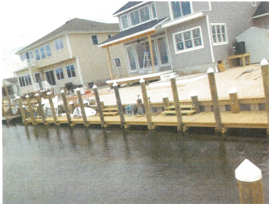
1 Peg Leg Way, Rear, 10/24/14