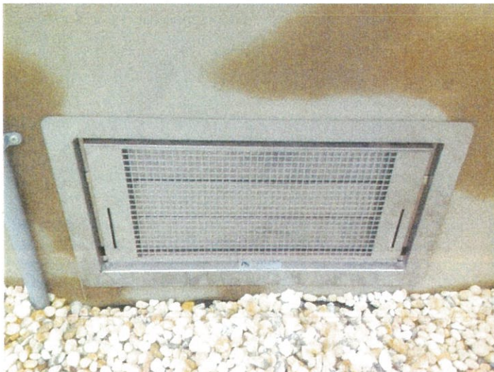
1 Peg Leg Way, Smart Vent, 10/24/14