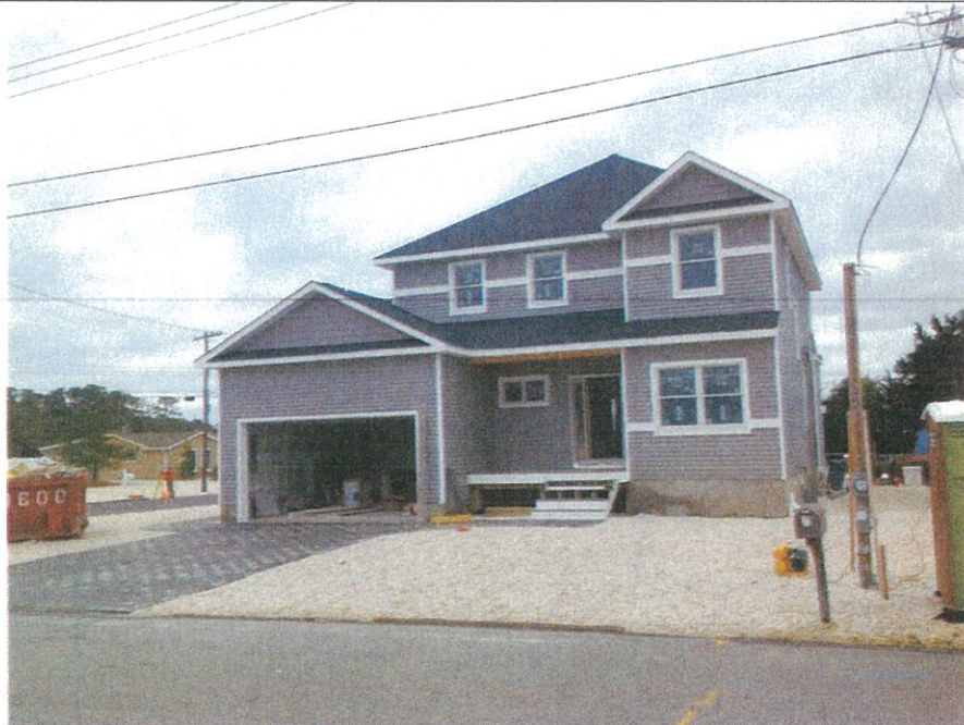
1 Peg Leg Way, Front, 10/24/14

If using the Elevation Certificate to obtain NFIP flood insurance, affix at least 2 building photographs below according to the instructions for Item A6. Identify all photographs with date taken; "Front View" and "Rear View"; and, if required, "Right Side View" and "Left Side View." When applicable, photographs must show the foundation with representative examples of the flood openings or vents, as indicated in Section A8. If submitting more photographs than will fit on this page, use the Continuation Page.